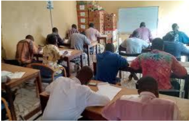
SOW students sitting exams