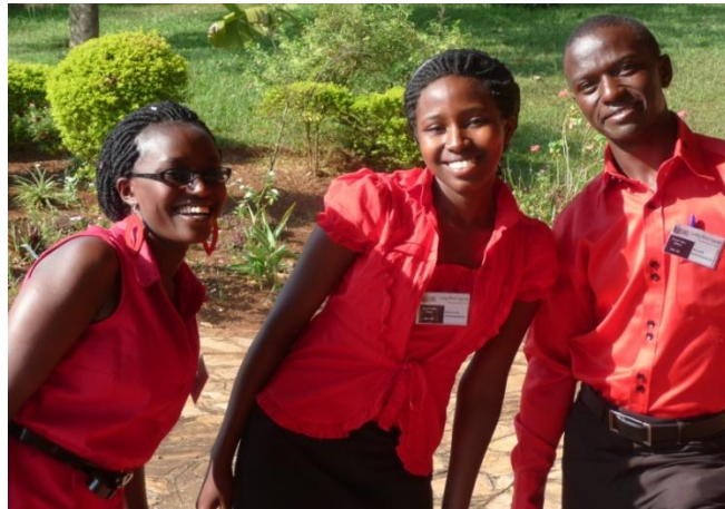
Thanks from the students!

Your support will make a wonderful difference!