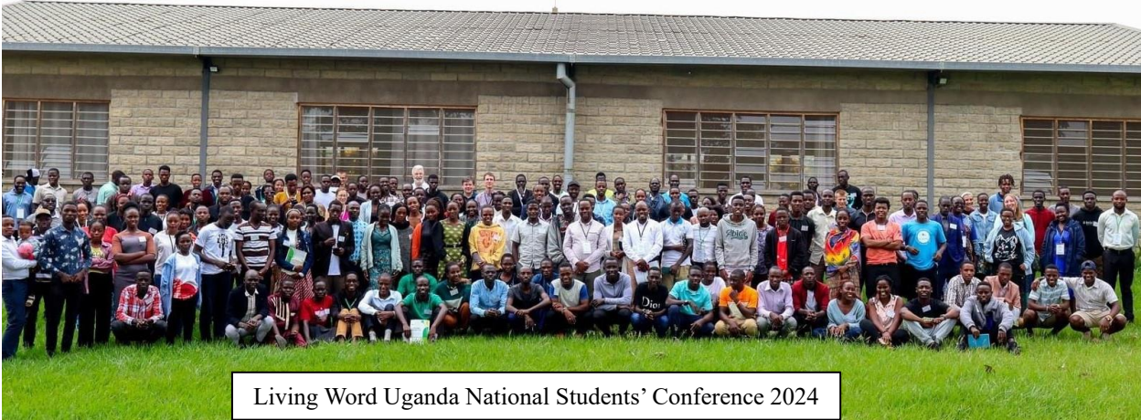
Living Word Uganda National Students' Conference 2024