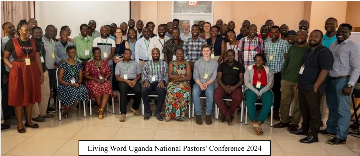
Living Word Uganda National Pastors' Conference 2024

"We are so hungry for this kind of teaching. It is exactly what our country so desperately needs."