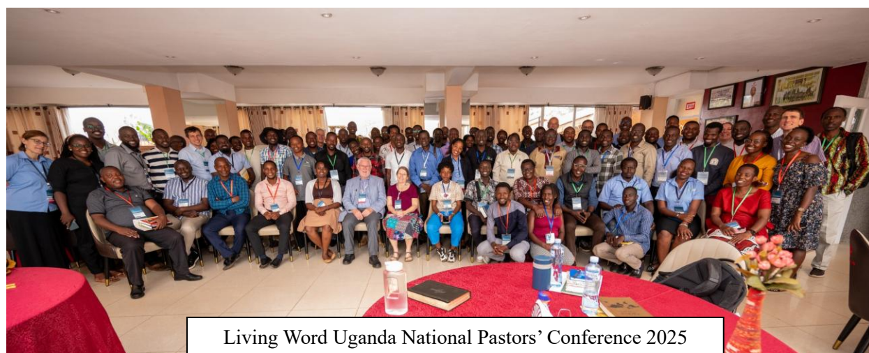
Living Word Uganda National Pastors' Conference 2025

"We are so hungry for this kind of teaching. It is exactly what our country so desperately needs."